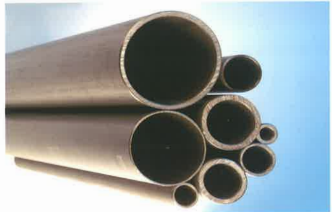
M. S. BLACK PIPES