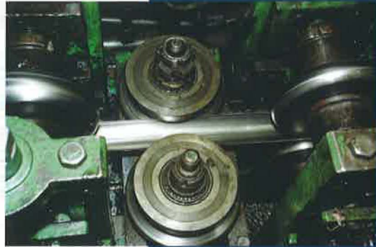
FORMING OF PIPES FROM SLITS