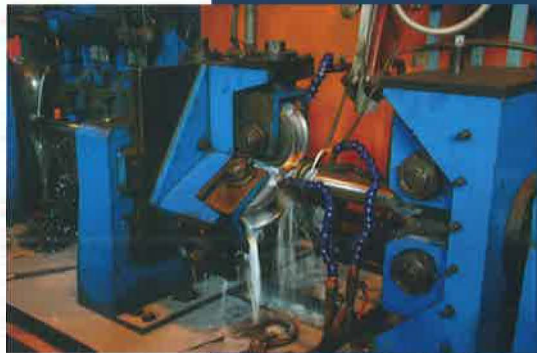
ELECTRIC WELDING OF SEAMS