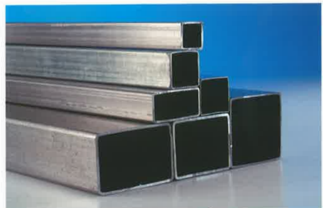
HOLLOW STEEL SECTIONS RHS/SHS